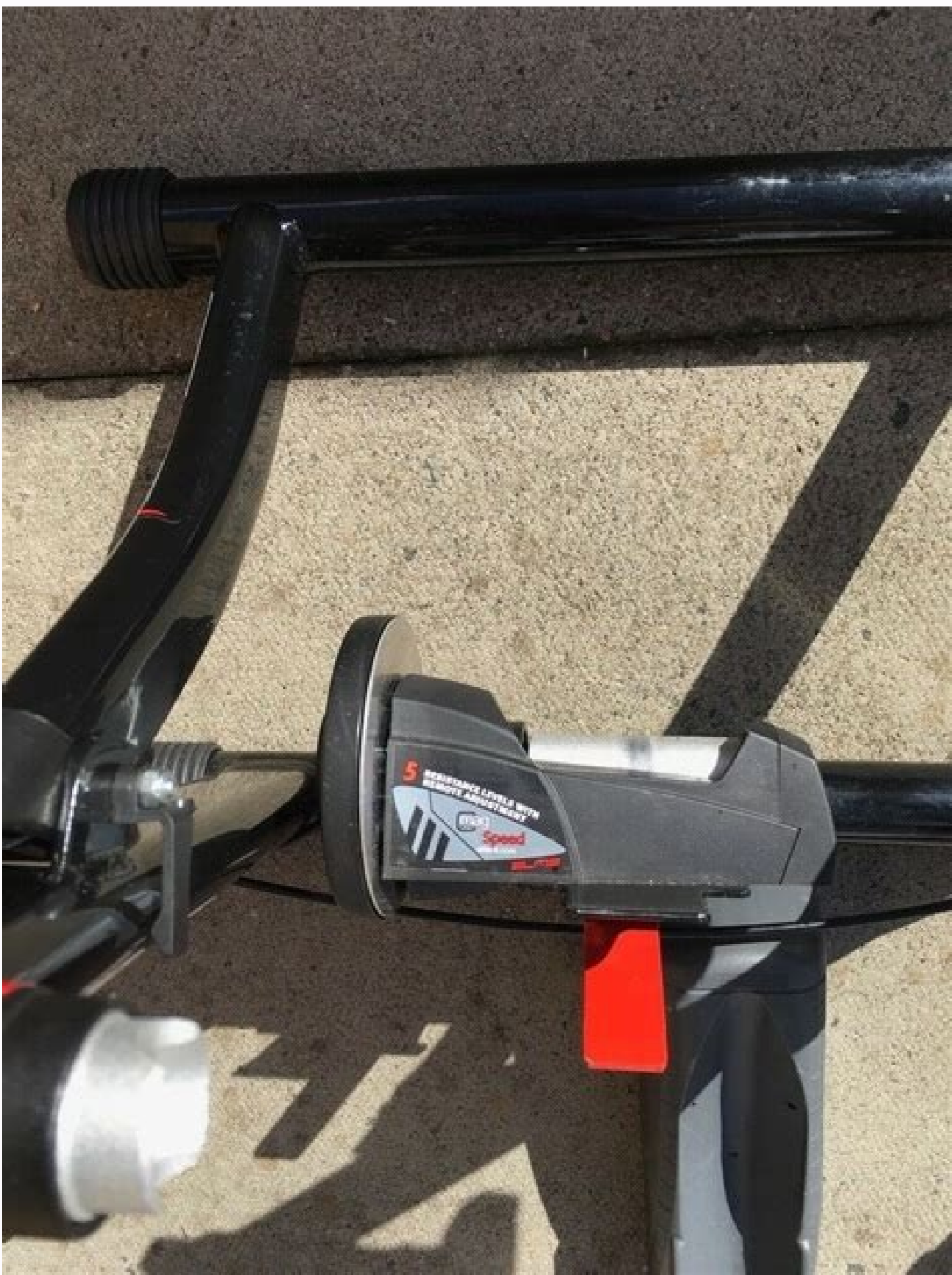
Elite volare zwift